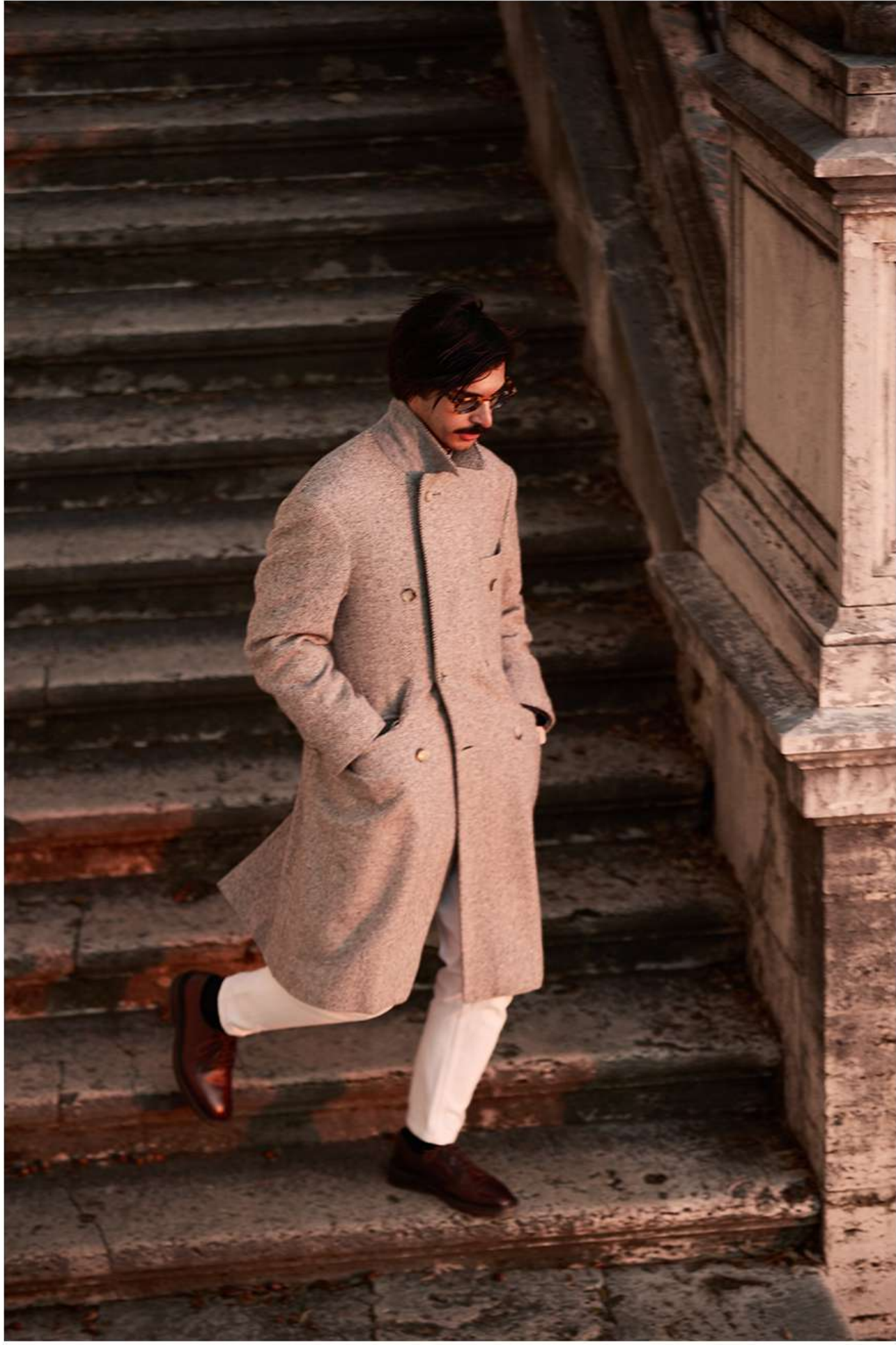
01_cappotto / coat